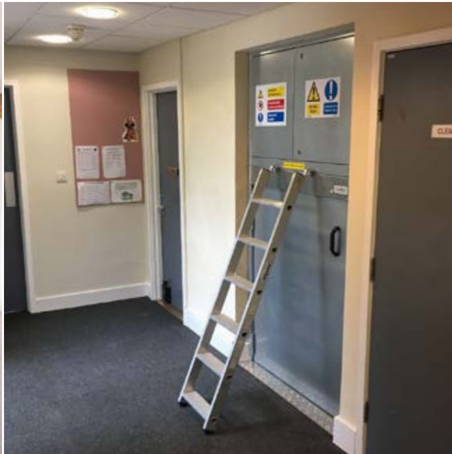
Ladder option to allow for access to the lift machinery

If you need advice, or want to talk about any of our products and how to achieve your desired objective, we are here to help.